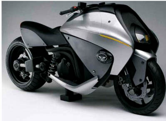
Above image, bottom row: the Suzuki Biplane and the Victory Vision 800 concept bike produced by Victory, a division of Polaris ATV's.