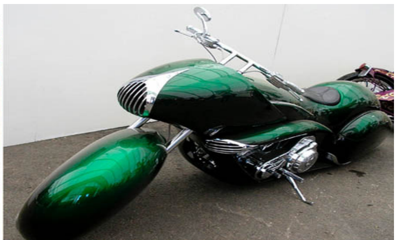
Imagine seeing this coming up behind you in your rear view mirror (below left)? On the right is the rounded green beauty, also seen at the Sturgis Motorcycle Rally: