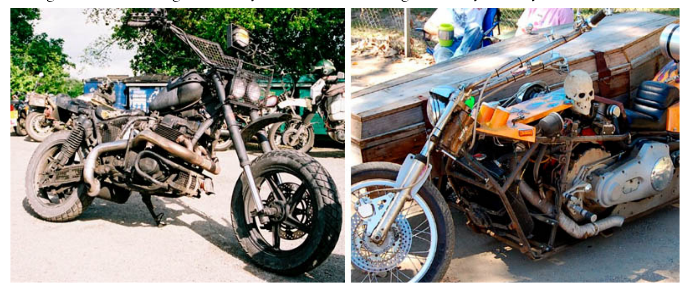
Rat bikes are usually defined as motorcycles that are decades old, in a poor state of repair, but still maintained and kept roadworthy by their owners on a shoestring budget