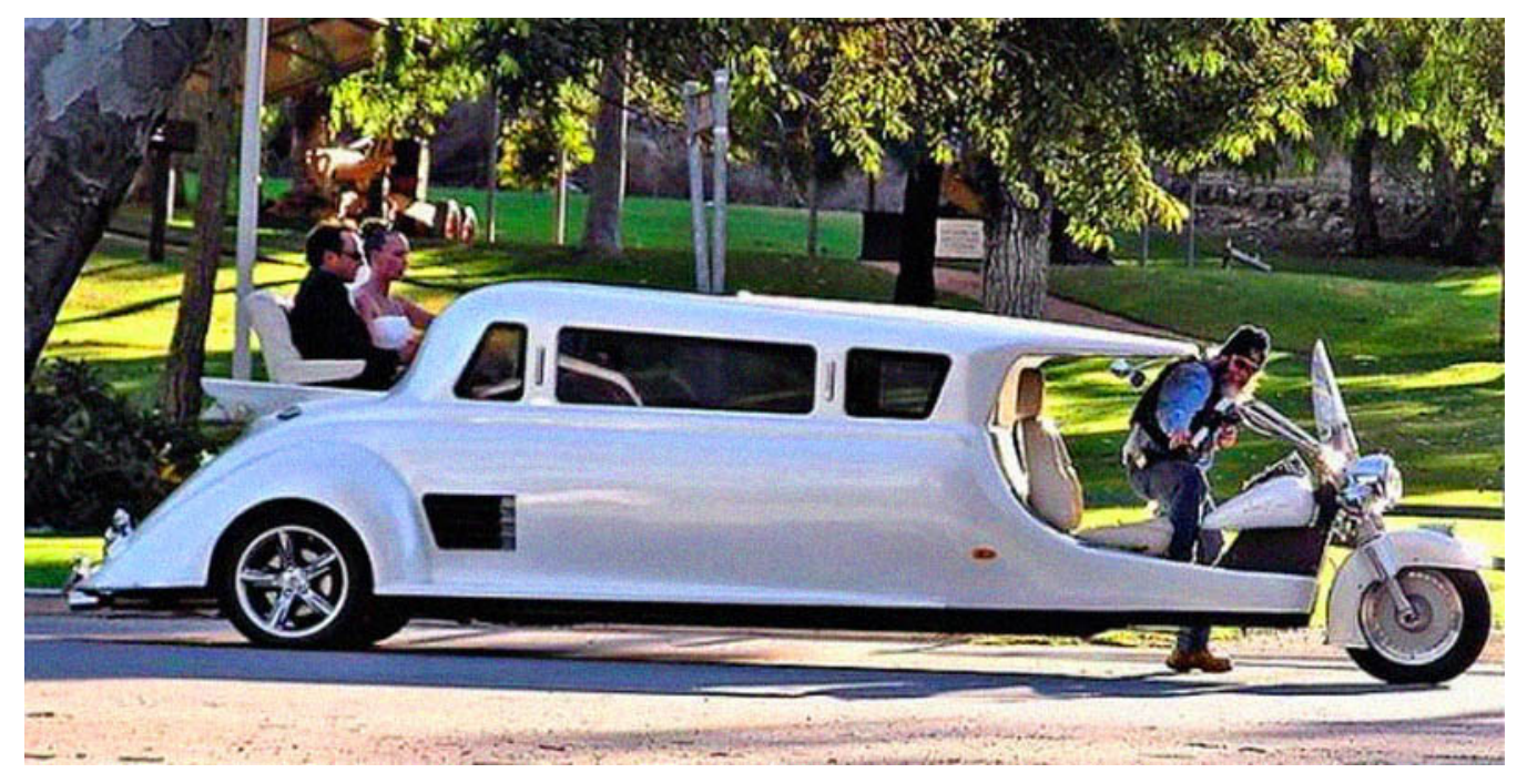
Want to travel in style? Why not try this Harley Davidson and limousine combination