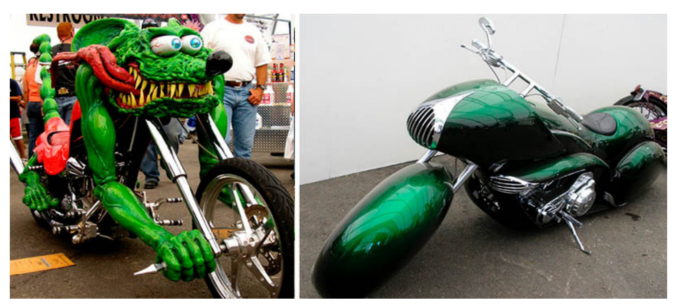
Imagine seeing this coming up behind you in your rear view mirror (below left)? On the right is the rounded green beauty, also seen at the Sturgis Motorcycle Rally: