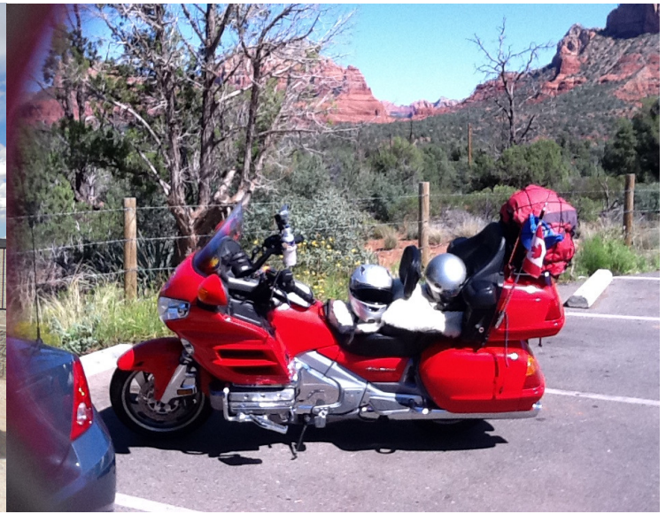
North of Sedona, AZ