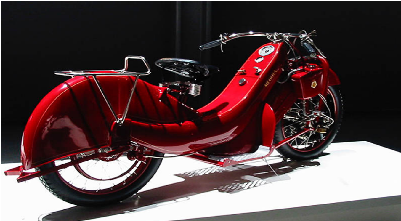
In 1935, the Killinger and Freund motorcycle was an attempt to make an improved version of the Megola, but the advent of World War Two put an end to any further development: