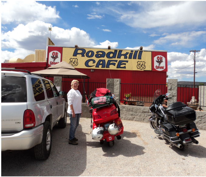
Road Kill Café, Seligman, AZ (Route 66)