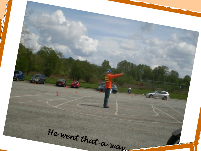
He went that-a-way...