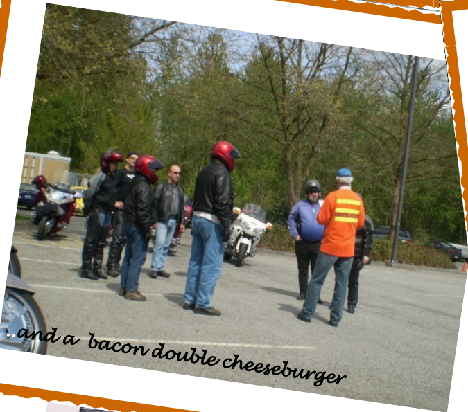
...and a bacon double cheeseburger