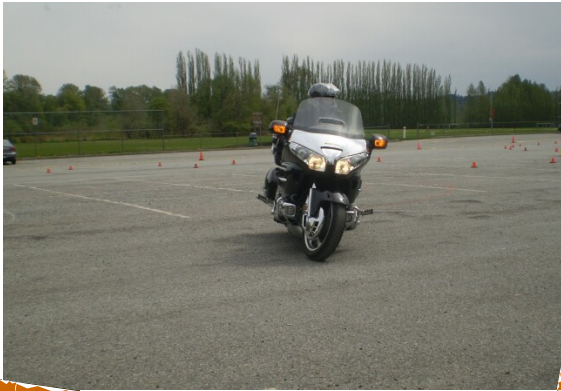
Oh..you mean the other Left...