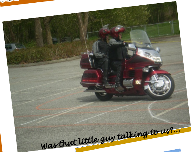
Was that little guy talking to us?...